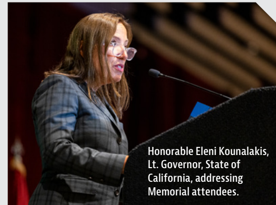
Honorable Eleni Kounalakis, Lt. Governor, State of California, addressing Memorial attendees.