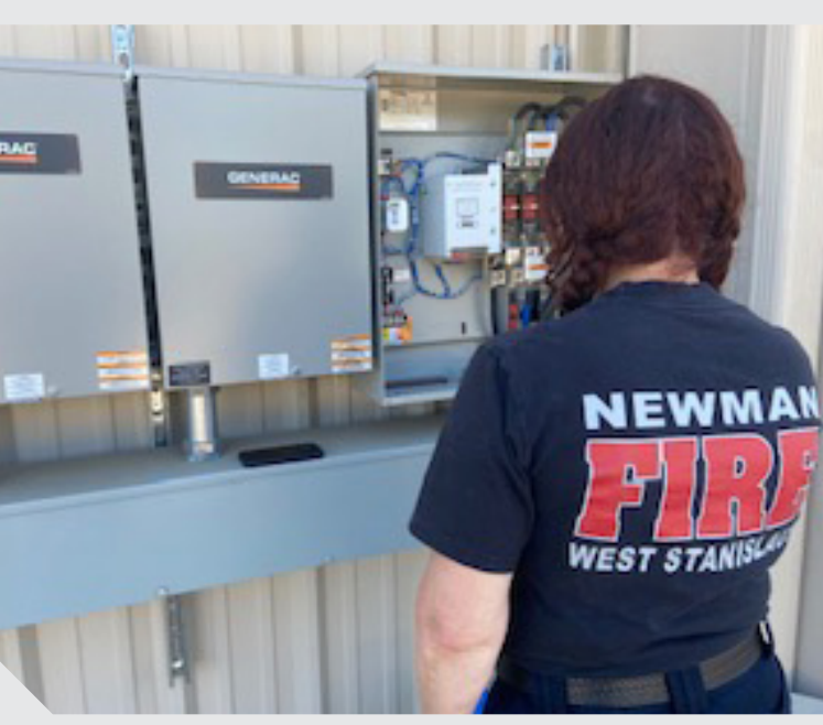
Newman Fire Department's grant funded the installation of transfer switches at their town's fire house to help when power goes out.

Tulare County Resource Conservation District & Sequoia Fire Safe Council's funding helped purchase and site 5,000 gal. water tanks in strategic fire prone areas for rapid water deployment and suppression support. Over 4,500 residents populate the "atrisk communities" within the grantee's service area, with eight communities within wildlands being designated as under-resourced.