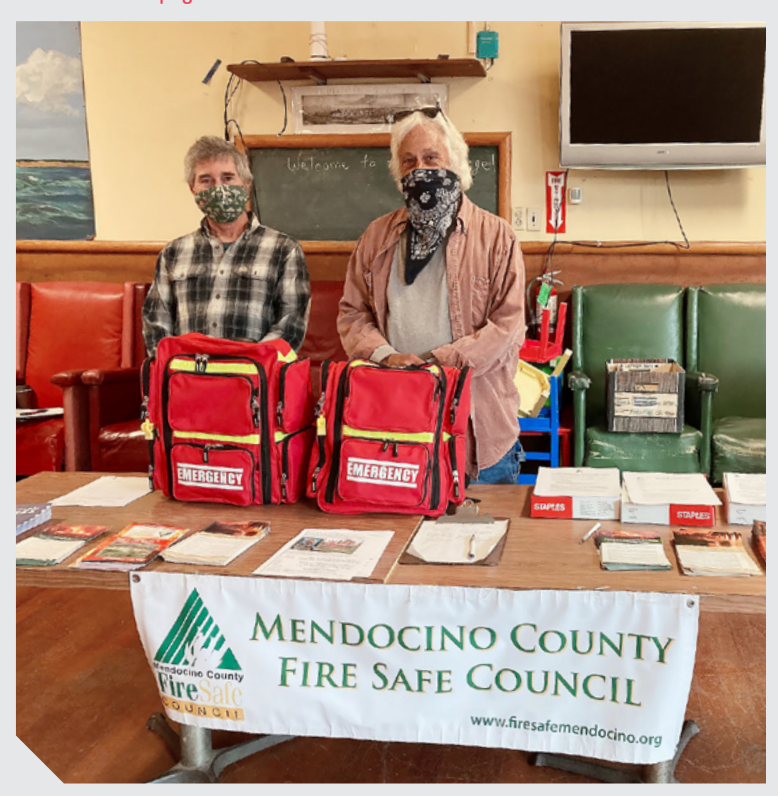
Mendocino Fire Safe Council, a fire preparedness/ prevention grantee, with their evacuation kit give-aways at a local community meeting.

"This award allowed Monterey Firefighters Association to purchase an emergency vehicle to help support evacuation efforts of community members who don't otherwise have vehicles or transportation available. This is a MUCH-needed resource and we're so grateful for CFF's help in making it possible."