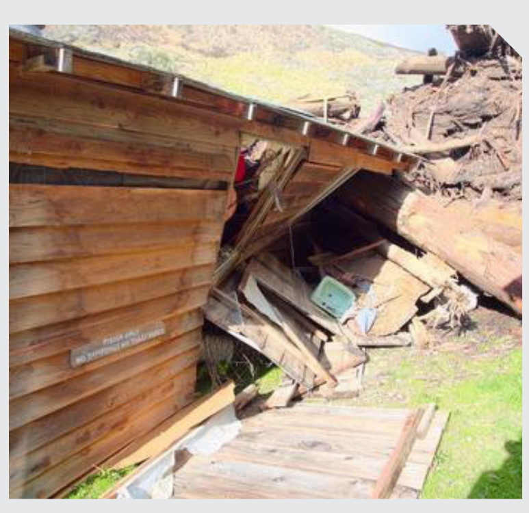
The California Fire Foundation awarded a grant to Community Emergency Response Volunteers of the Monterey Peninsula (CERV) to aid residents impacted by mudslides and debris flow resulting from the 2020 wildfires in Monterey County.

- Central Calaveras Fire Protection District