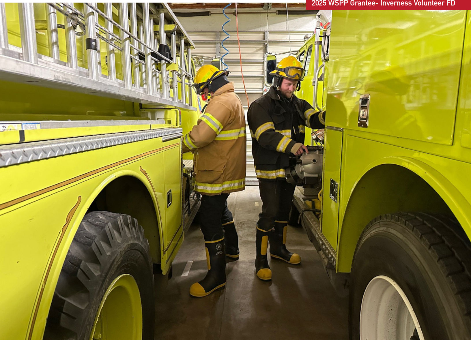
2025 WSPP Grantee- Inverness Volunteer FD